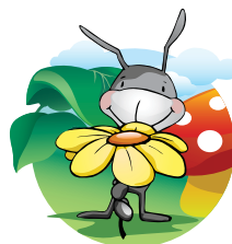
Smell the flower