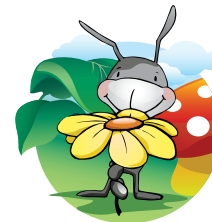
Smell the flower