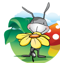
Smell the flower