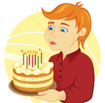
Blow out the candles