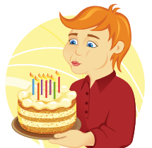
Blow out the candles