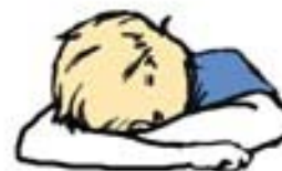
PUT MY HEAD DOWN