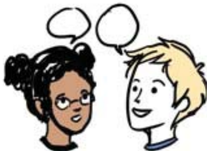
TALK QUIETLY WITH CLASSMATES