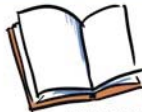
READ A BOOK

I DIDN'T KNOW WHAT TO DO AT FIRST, SO I MADE A LIST TO HELP ME DECIDE.