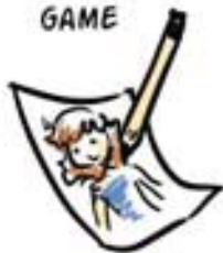
DOODLE OR SKETCH