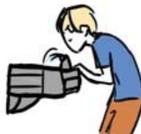
GO TO THE WATER FOUNTAIN OR THE BATHROOM