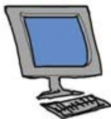
USE THE COMPUTER